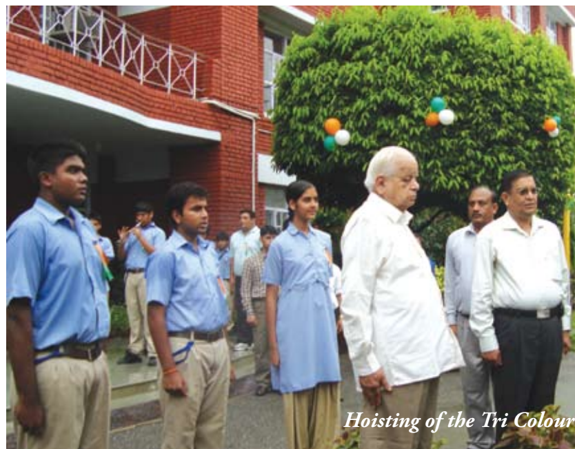
Hoisting of the Tri Colour

He talked about the various challenges faced by the country throughout the years since its independence. He further mentioned the various